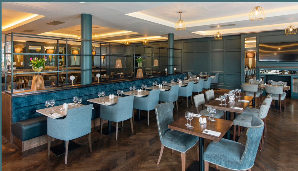
Wooden Pestle Restaurant Area