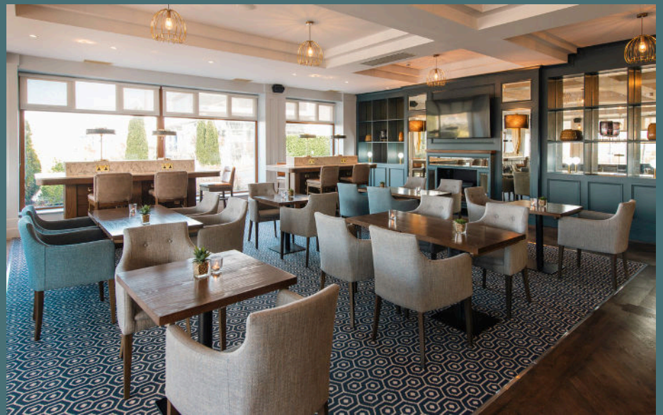
Wooden Pestle Bar Area